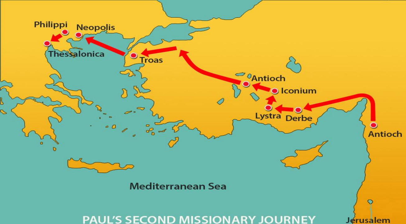
PAUL'S SECOND MISSIONARY JOURNEY